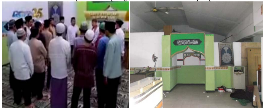
Figure 1: The Mosque of Kampung Duku in TBNH Soap Opera

The stripping system impacted on the delay script and consequently the soap opera made carelessly. To anticipate, the selection of players with some criteria like pretty, handsome and famous are always as a consideration. In addition, some of the main background of conflict and dramatization often come from the society daily life with theme is religion teaching by presenting such images such as mosque, veil, pious family, etc., they were always contrasted with the ugliness and evils symbols.