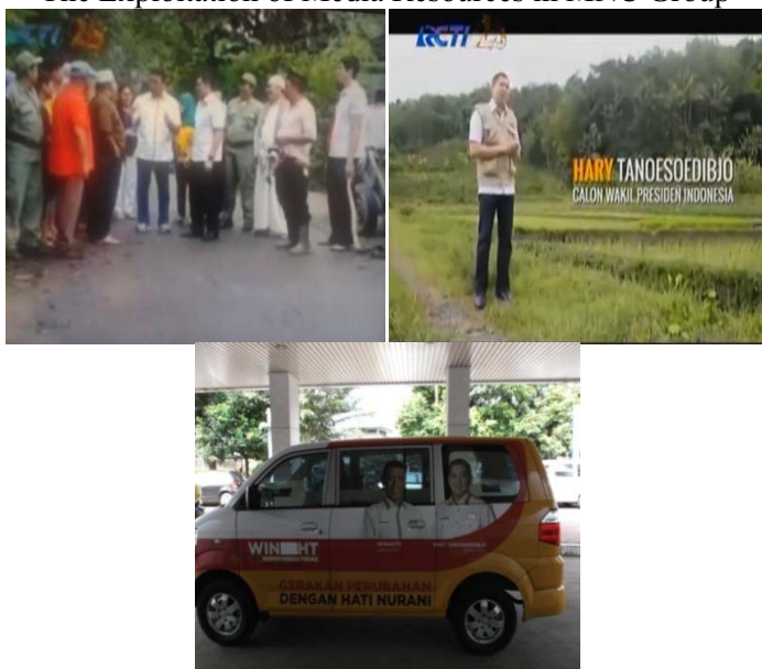
Figure 2: The Exploitation of Media Resources in MNC Group

through soap operas, reality shows, and even the operational vehicles of the company.